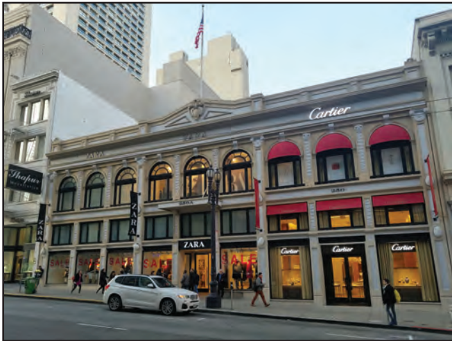
The Cartier space is a portion of the premises that housed the historic Gump's store for nearly a century.